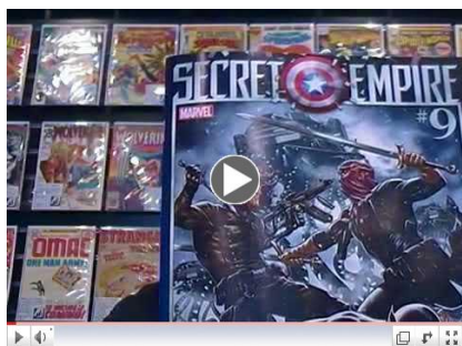
Weekly Comics for the week of 8/23/17